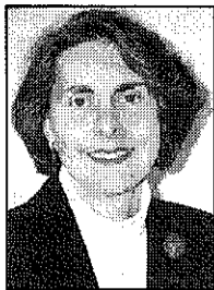
By Theodora Dracopoulos Argue