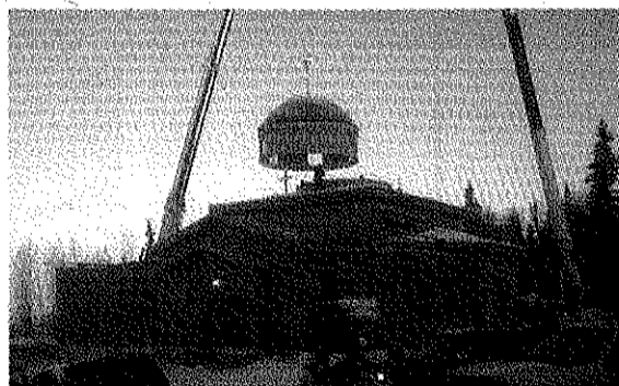
Raising of the Dome on the new Holy Transfiguration Church in Anchorage, AK .

On December 1, 2010, the dome was raised onto the roof of the new Holy Transfiguration Church in Anchorage . Construction started in May. The placing of the dome took place amidst snow and cold. While much work still remains to be done, the parish's goal of enclosing the structure has been achieved before the worst of the winter weather falls on Anchorage. The day